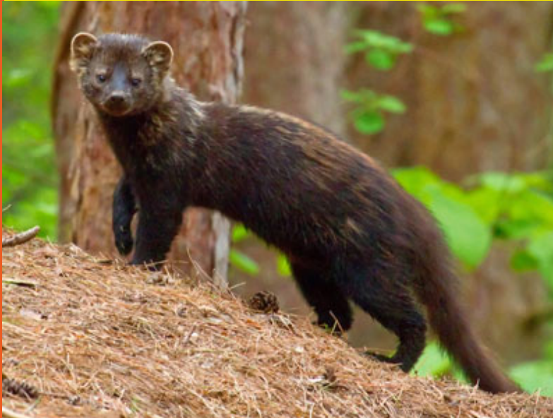
Above: A fisher cat in the wild.

I was talking last week with a man in our town, who is in his 97th year and has owned at one time over 2000 acres. He agreed that my observation was right. I can remember when the porcupine was protected as they were